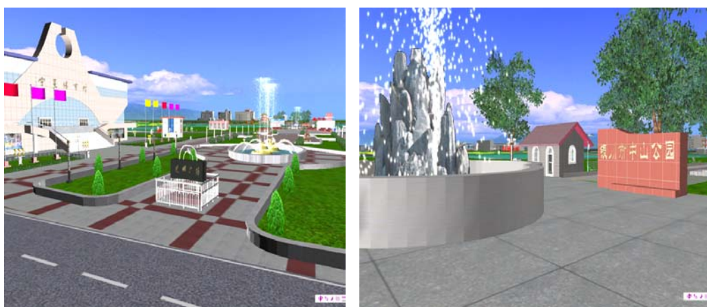
Figure 2 3D simulation scene

The high resolution satellite image, digital elevation model, various fabricated ground object model and road, lawn, space, water body and other 2D vector lines and planes collected from high resolution satellite images corrected by orthograph are integrated and matched to corresponding texture models to generate 3D virtual blocks (Fig. 2).